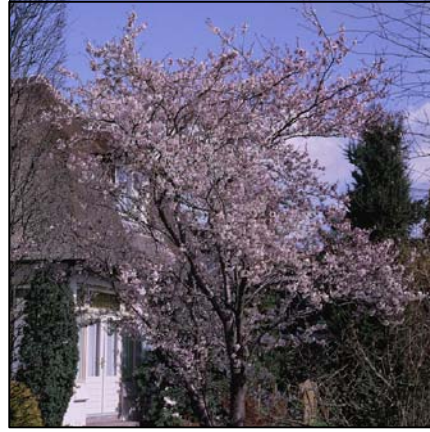
Prunus Autumnalis Rosea