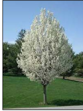
Flowering Pear Tree