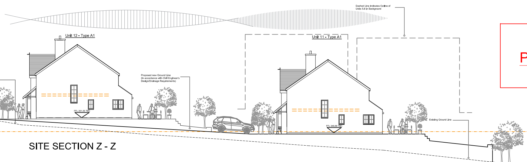
SITE SECTION Z - Z